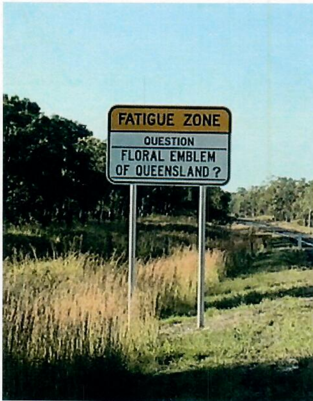
Trivia sign on the Bruce Highway

The Cooktown Orchid is so synonymous with Queensland as the state's floral emblem it is even an 'anti-fatigue trivia' question at various sites on the Bruce Highway that runs along the coast from Brisbane to Cairns. It is widely regarded as Australia's most attractive endemic orchid. For many people the very name 'Cooktown Orchid' invokes images of tropical rainforests running down to seas filled with coral, and beaches with waving palm trees. However, this is not so, it is instead mostly found in the very different biographical zone of the open forests of Cape York Peninsular, rather than growing in the renowned Wet Tropics to the south of Cooktown as is widely believed. (Lavarack and Gray, 1992).