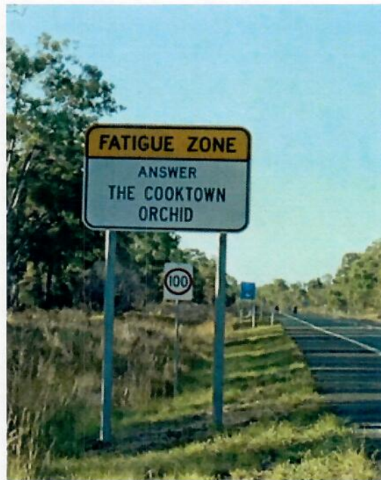
The trivia answer sign.

If you would like to see more of what Queensland has to offer in colours other than the Maroon of football fame, keep a place on your calendar for September 14-15, 2019 as the Rockhampton Orchid Society will be hosting the 10th. Sub-Tropical Orchid Council Conference and Show, in Rockhampton, Australia's first tropical City and The Beef and Barra Capital situated on the Tropic of Capricorn by the mighty Fitzroy River. Details and updates will be appearing in Orchid Australia from now on and also on the Rockhampton Orchid Society Inc. website www.rockhamptonorchidsociety.com.au We hope you can join us; you may not be able to see a Cooktown orchid in the wild; but I know there are many gardens where a Curley Pink may be on offer.