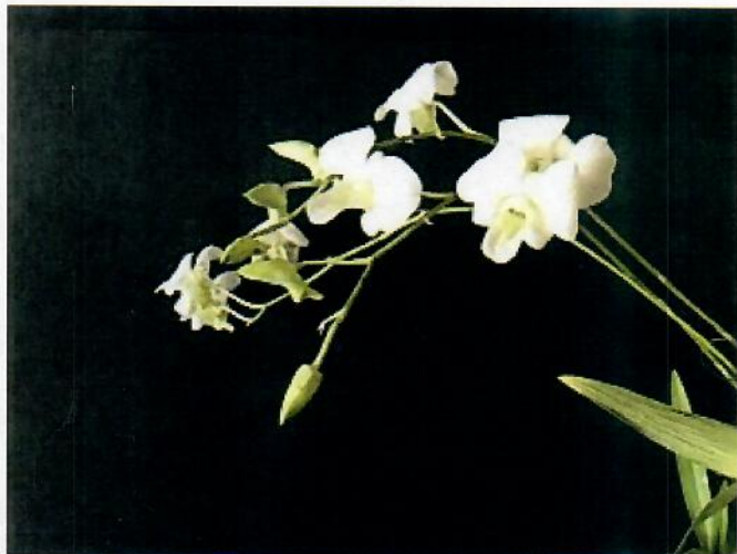
Den. bigibbum fma. alba (owner T Dean)

This orchid is highly variable in variety and form, there are also recognized sub-varieties and sub-species (ssp.) and historical synonyms still in use; a veritable taxonomists nightmare. Without delving too far in to this botanist's minefield, it is safe also to say that alba forms are far from uncommon and the very 'light blue' form 'coerulea' is also often seen in cultivation in Queensland. In addition, there is the question of Dendrobium phalaenopsis which was once regarded as a synonym for bigibbum ; nomenclature that can still be found in use. However, it is now