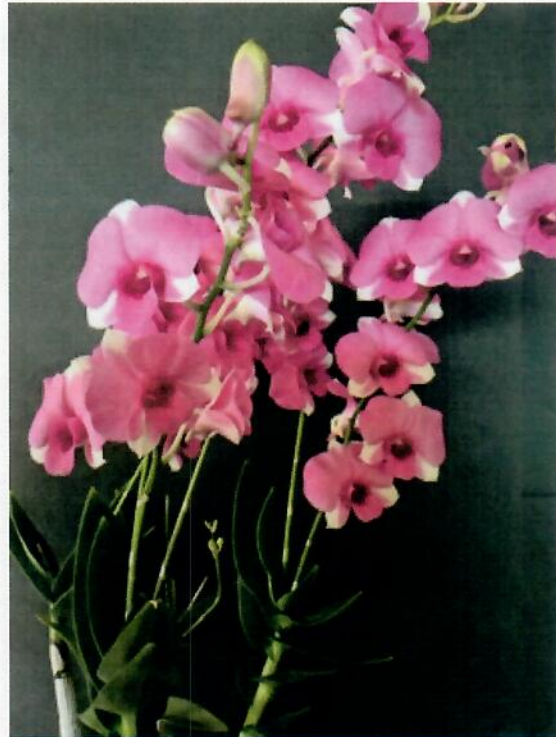
A modern phalaenanthe Den. hybrid derived from the Cooktown Orchid

Yet another feature of this endearing 'Aussie Wonder' is its propensity for not only breeding in artificial conditions, but its natural partnership with what could be regarded as the 'Aussie Battler' of orchids', Dendrobium discolor , also known as the 'Golden Orchid'. This species is found growing in many diverse locations such as, from mangrove swamps to open forests, ranging to the tip of Cape York to Central Queensland. It is very hardy, has long lasting flowers and produces many root – laden plantlets from its robust canes and can form huge clumps on trees and rock faces when these adhere to the hosts' surface. When found growing together they give us the beautiful botanical gift of the natural hybrid Dendrobium X superbiens , known colloquially as 'Curley Pink'. In its natural situation It is