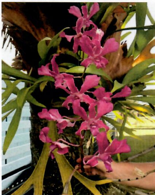
Den. Curly Pink in the author's garden showing a seed pod and plantlet (kiekie), far right.

Once established It can be quite prolific thanks to its plantlet producing propensity also inherited from discolor and is found growing in many gardens throughout Queensland on host trees such as Palms and Frangipani. The latter are perfect host as they tend to defoliate to some extent in Winter in central and southern Queensland locations, and then provide a full canopy in Summer that gives protection from