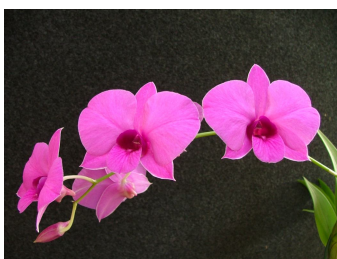
Den bigibbum v compactum

One of the main ingredients for growing good Dendrobiums is plenty of air movement. If you can achieve this you are half way there.