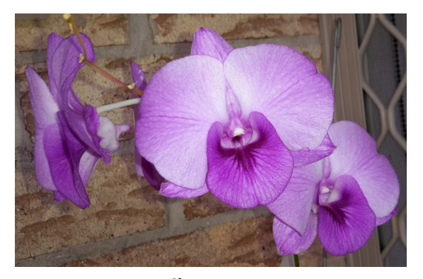
Den. Dal's Stunner X Den. Tanamera Beauty 'Hailie'