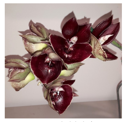
Ctsm. Orchidglade ' Jack of Diamonds'