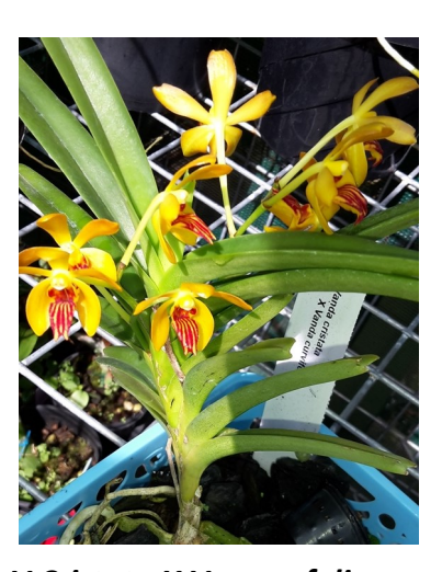
V Cristata X V convufolium