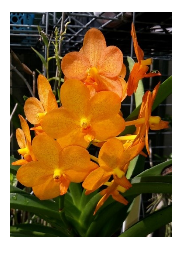
V. Su Fun Beauty