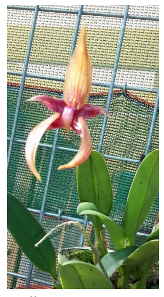
Bulb pingtungensis X Bulb echinolabium