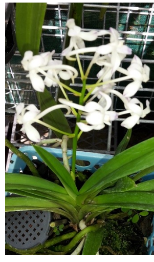
V. Lou Sneary