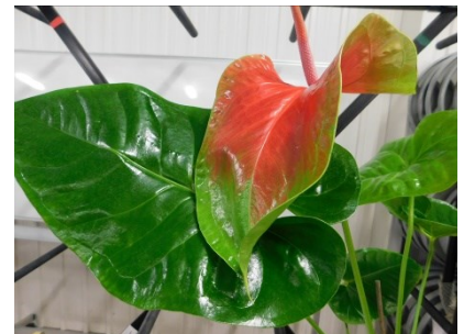
People's Choice—Foliage Anthurium andraeanum Growers — P & D Firth