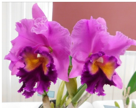
Judges Choice Novice C. Unknown Grower—D & B Birt