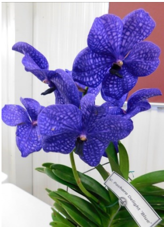
People's Choice—Orchids V. Pachara Delight 'Blue' Growers — N & S Jensen