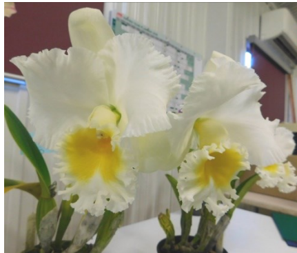
Rlc. Chincogan 'Belle'