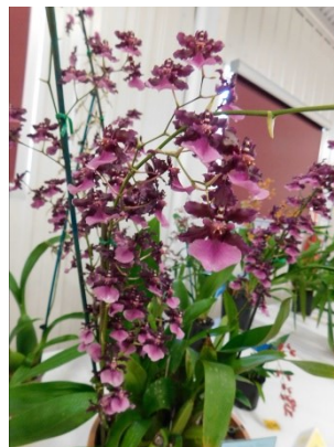
Onc. Sharry Baby 'Red Fantasy'