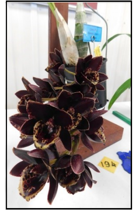
Fdk. After Dark 'Baker's Cherry Madness'