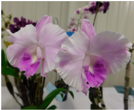
Den. White Comet 'Orchid World'